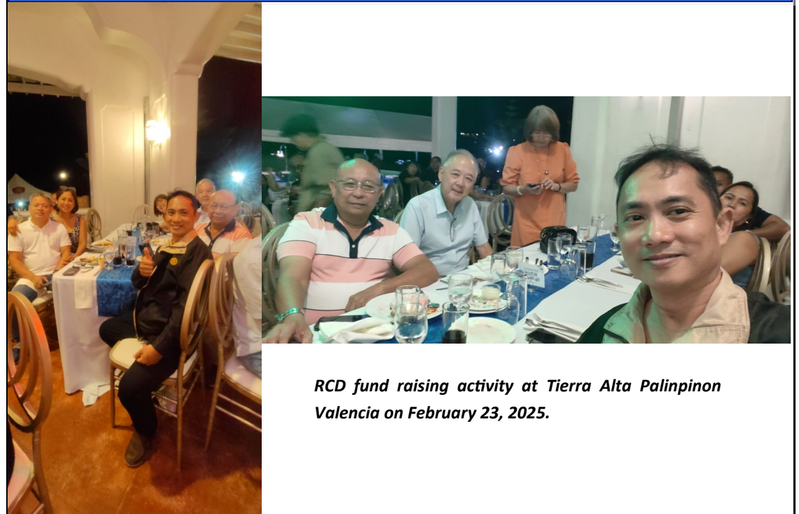
RCD fund raising activity at Tierra Alta Palinpinon Valencia on February 23, 2025.